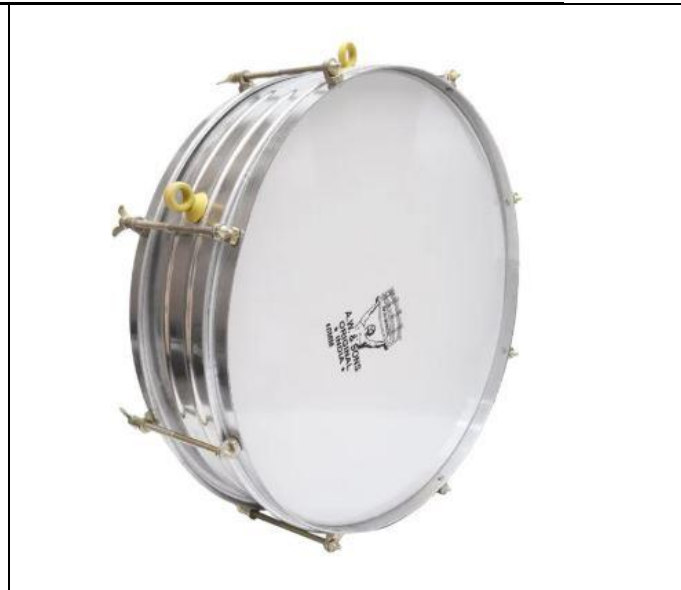
Sample picture of Drum for Assembly (Item No.20)