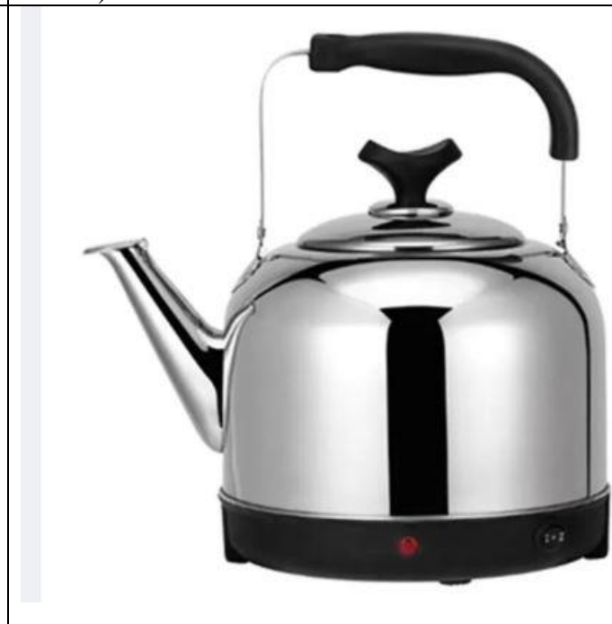
Sample picture of Electric Kettle (Item No. 5)