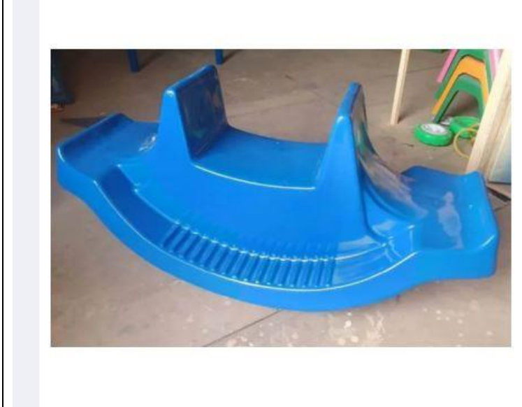
Sample picture of Dhikichyau (Item No. 42)