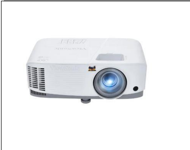
Sample picture of Projector (Item No. 1)