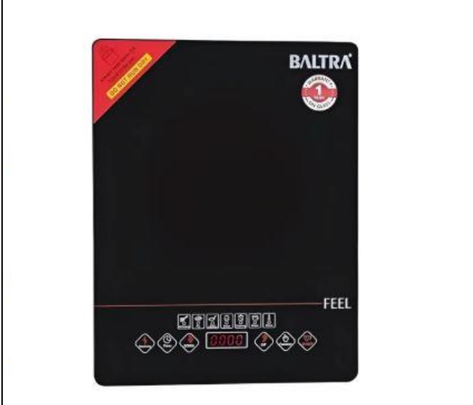
Sample picture of Induction Cooktop (Item No. 85)