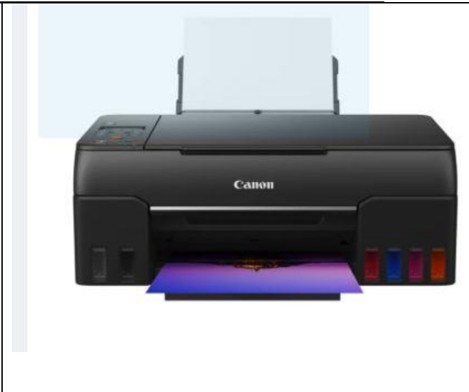
Sample picture of Color Printer (Item No. 9)