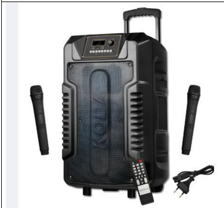
Sample picture of Sound System with Speaker (Item No. 3)