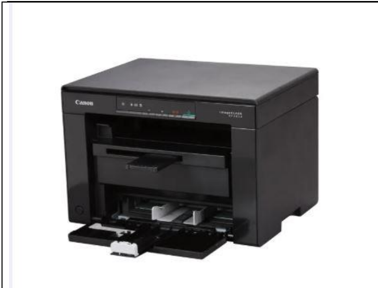
Sample picture of Printer (Item No. 2)