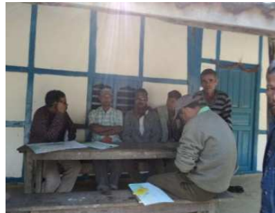
Meeting with CFUG